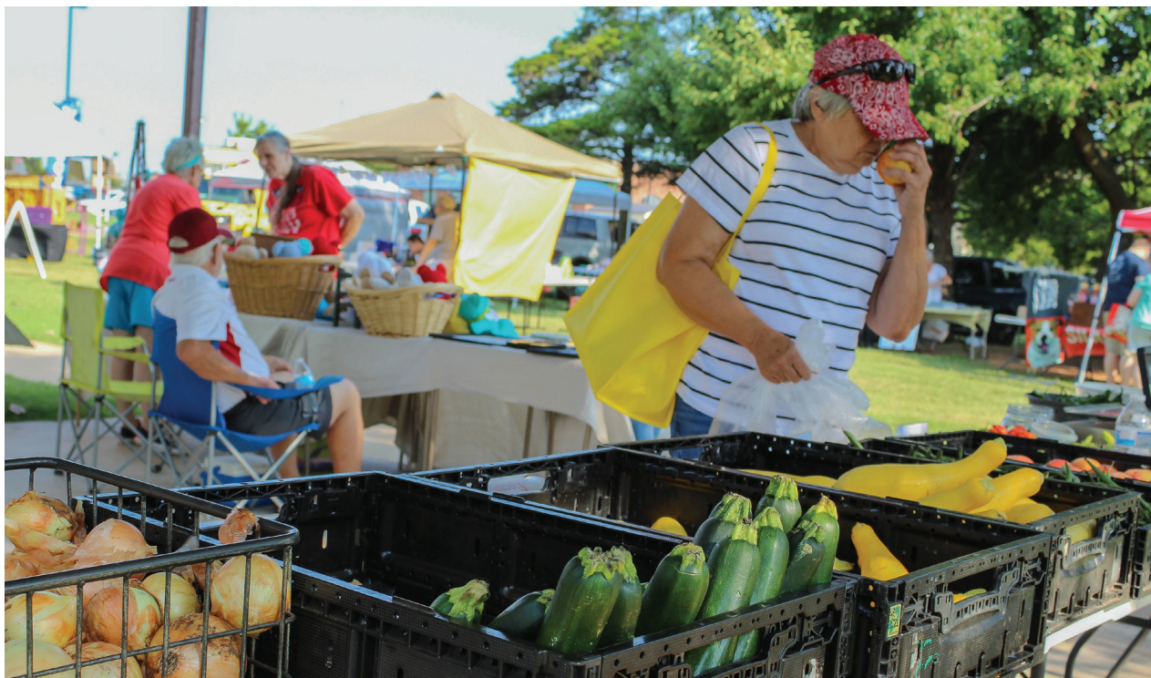
A resident takes a whiff of a veggie at Wildhorse's Farmers Market Aug. 7. Wildhorse Gardens and Market sells fresh vegetables, homemade goods and more from 6 to 8 p.m. Wednesdays and from 8 a.m. to noon Saturdays. The organization accepts Supplemental Nutrition Assistance Program benefits. Market days are ongoing until September.