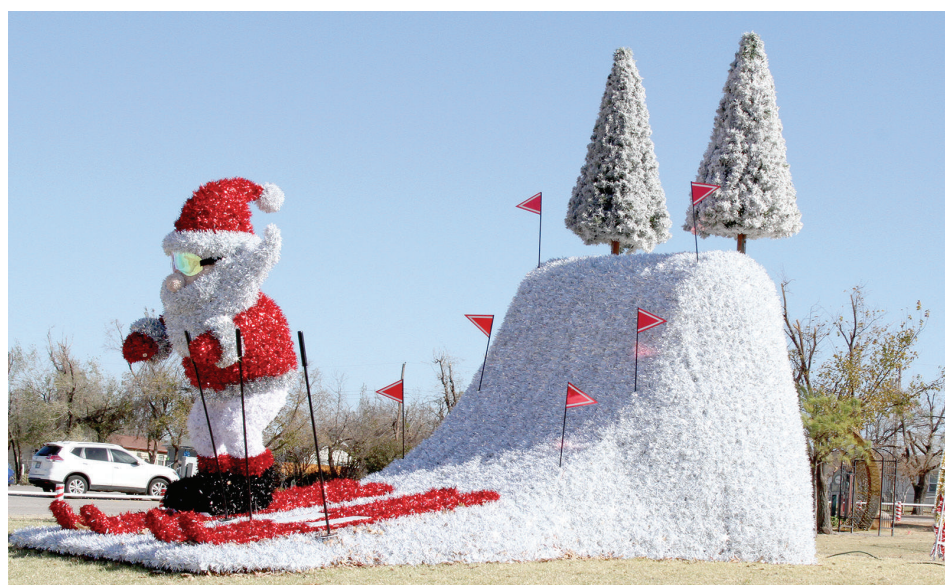
One of the displays included with Christmas in the Park is shown near the Oklahoma parking lot in Chisholm Trail Park. The festive light show, complete with a skating rink, will open Saturday at 6 p.m. It will be open nightly through Dec. 31.

You can also call (800) 826-5433 (LIFE).